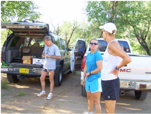
ARR members congregate near the start of the Devil's Throne Run, held in Cerrillos, NM

As usual, there was no charge and there were no awards. This is a very laid back run with the total distance being about five miles. Most of it is done on a dirt road that includes the climb up to the steep, notorious Devil's Throne. It is a difficult ascent but the runners and walkers were rewarded with the wonderful downhill portion on the other side. They all knew, however, that they would have to climb back to the top of Devil's Throne on the way back to the finish but somehow that is easier to do when you know that you are almost home and that there is good food, cool drink,