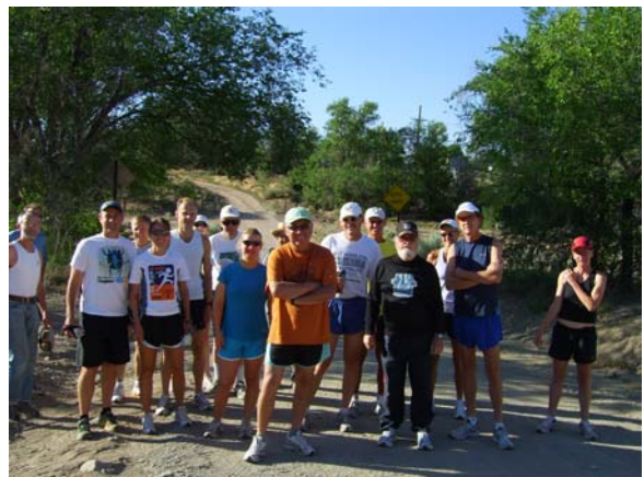
An eager group of ARR members await the start of the annual Devil's Throne Run. See story on page 8.